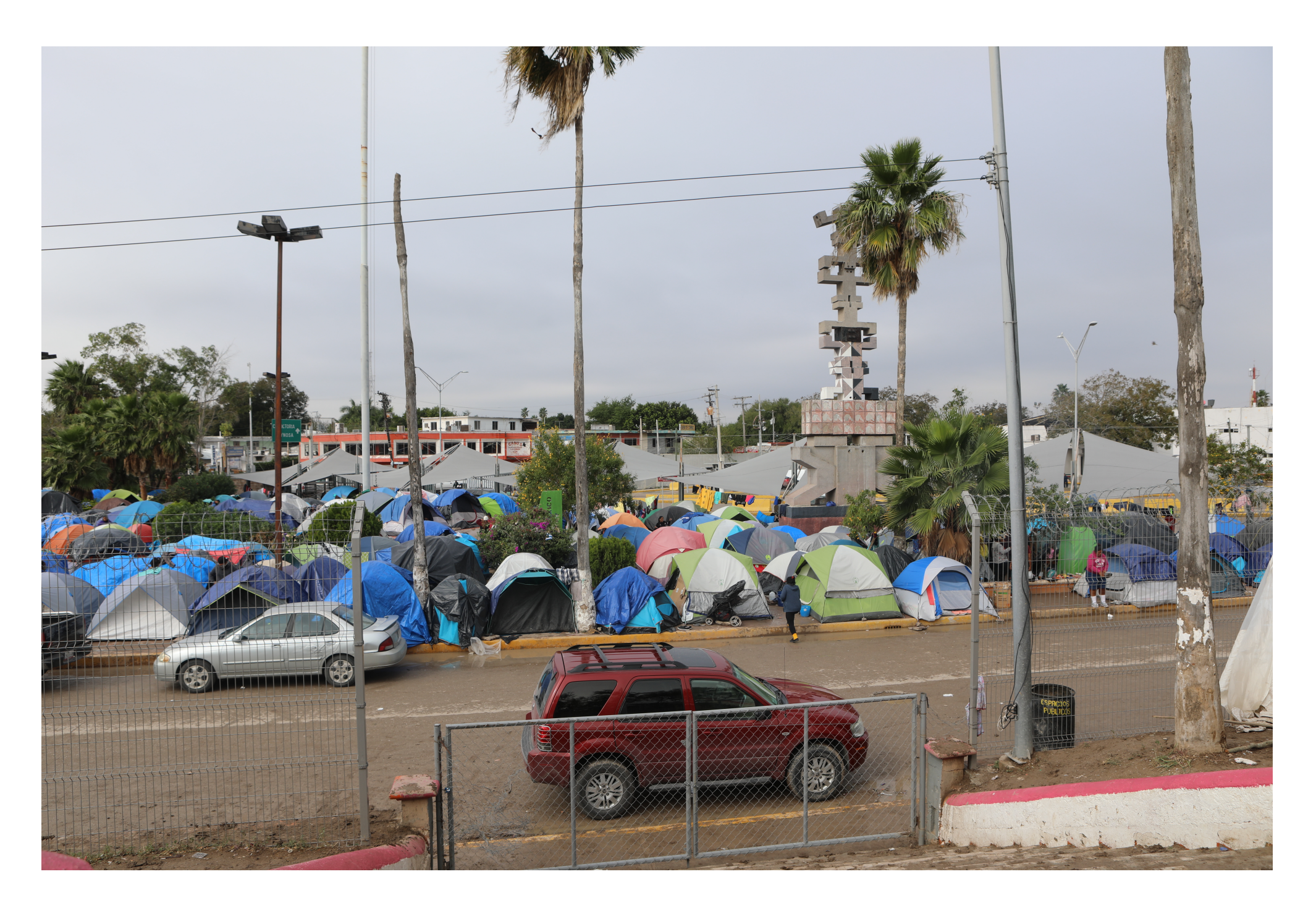
Photo. Open-air encampment of asylum seekers awaiting hearings, Matamoros, Mexico.

According to MPP, "[I]ndividuals from vulnerable populations may be excluded on a case-by-case basis" from the policy, (7) yet U.S. border agents have continued to force those with disabilities and other vulnerable individuals back to Mexico. The asylum seekers are largely in tents and overcrowded shelters without access to safe social distancing to protect against transmission of COVID-19. Most asylum claims under MPP are denied.