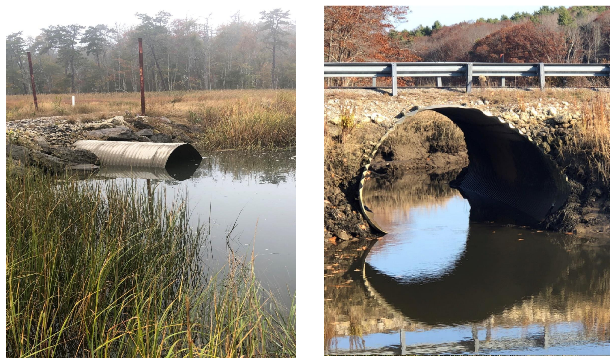
Flying Point Road culvert (left) and Williams Road culvert (right)

Georgetown is a coastal Maine town with over 200 culverts, most of which were surveyed and analyzed by past student groups. This year's project focused on two culverts that carry tidal channels beneath marsh-top roads. Tidal culverts must support two-way flow and are more difficult to analyze.